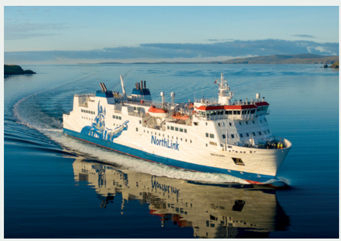
MV Hjaltland, along with MV Hrossey, sails from Aberdeen to Shetland

The Northern Isles are breathtaking and wild, rich in Norse and Scottish history, wildlife, delicious food and drink, unique folklore, music, poetry and prose. Orkney and Shetland are both quite unlike anywhere else in the UK. With NorthLink Ferries they're closer than you think.