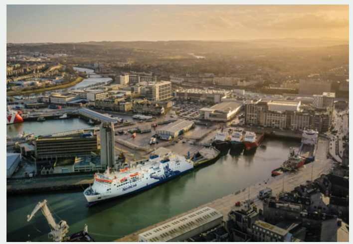
MV Hjaltland docked in Aberdeen

NorthLink Ferries operate a 90-minute crossing up to three times a day between Scrabster and Stromness in Orkney. MV Hamnavoe is the only ferry crossing to Orkney which passes the breathtaking sea stack, the Old Man of Hoy.